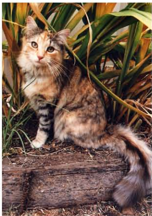
Rose ← Pip →

After Iceland, I went to the Netherlands for just 2 days to visit the lab, and then on to Ireland (with associated random but amazing couchsurfing experiences) for the European Document Experts Working Group conference (funded by the National Institute of Forensic Science). It's always nice to be surrounded by people you have things in common with, especially when they're as friendly and open as the European Forensic Document Examiners.